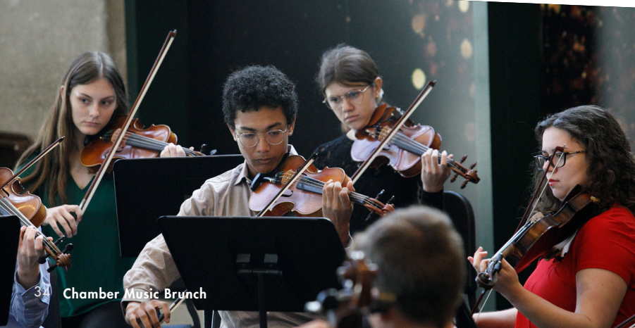
Chamber Music Brunch