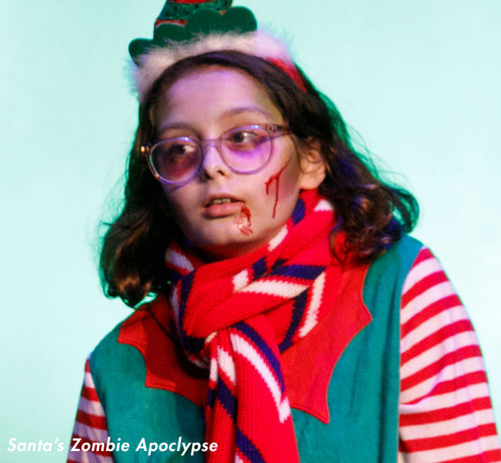
Santa's Zombie Apocalypse