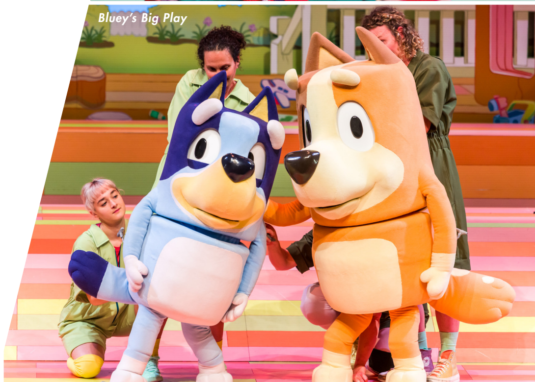
Bluey's Big Play