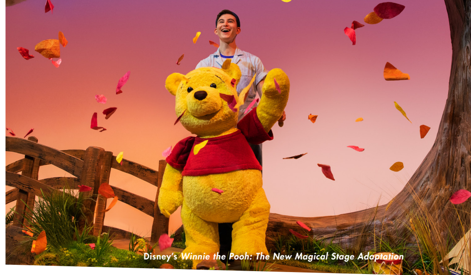
Disney's Winnie the Pooh: The New Magical Stage Adaptation